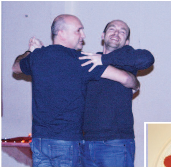
Most elegant pair of LADIES!! a bit less of the cake opposite might help fellas.