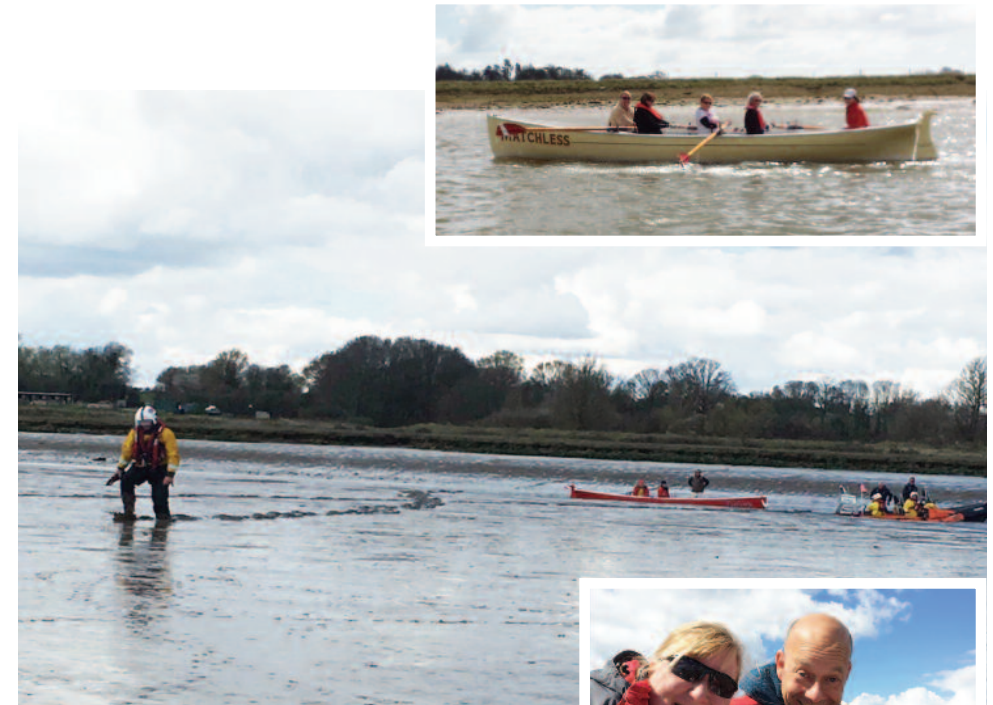
Top Right: everything started out ok