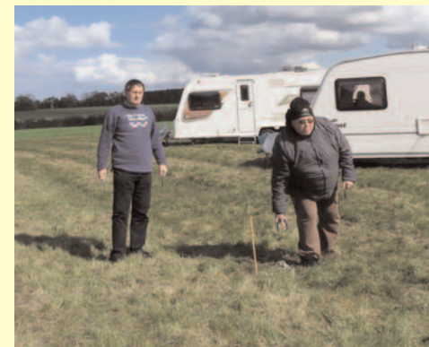
Current Trophy holders