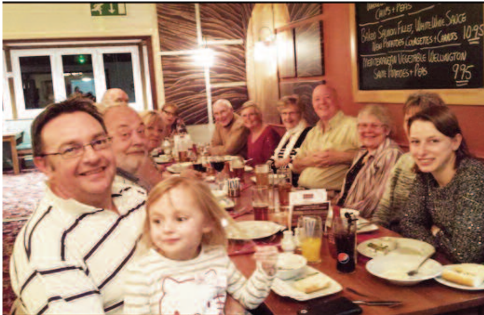
An enjoyable meal was had by all the ralliers, including young ralliers of tomorrow