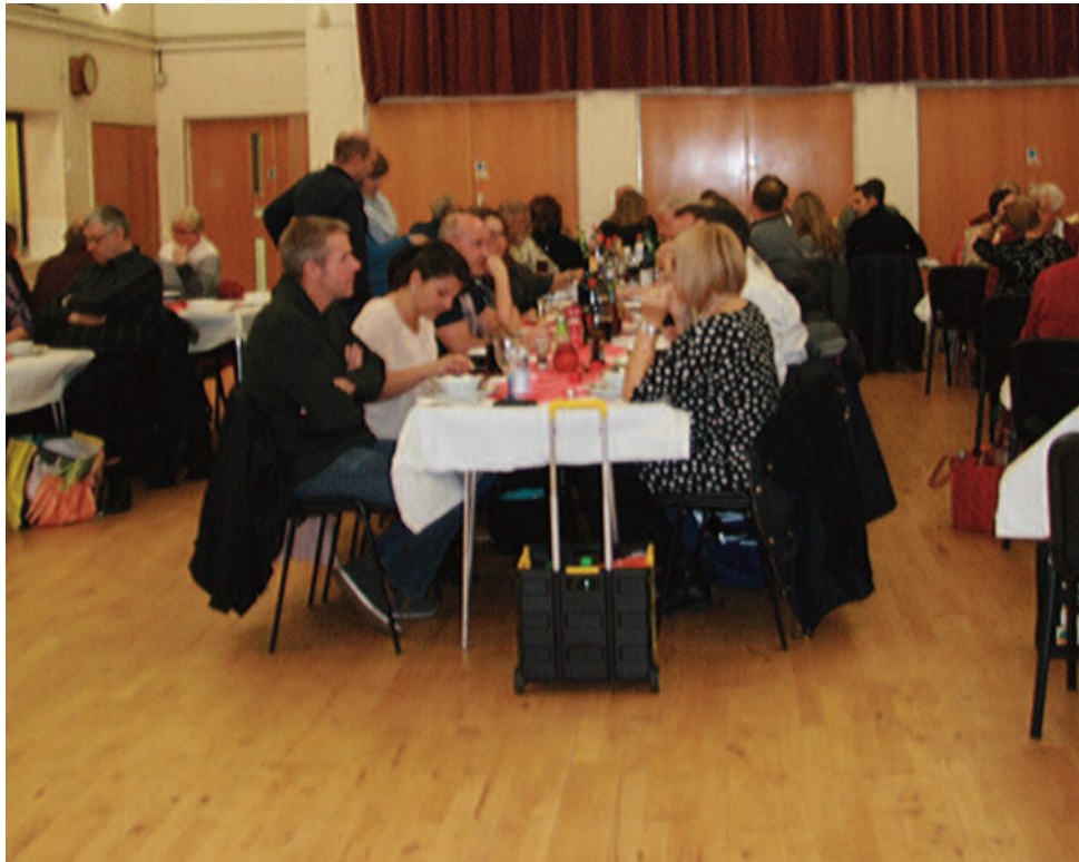
Members enjoying the meal at Valentines