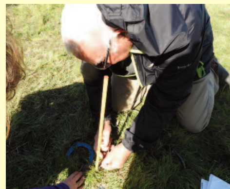
Getting the measurements correct