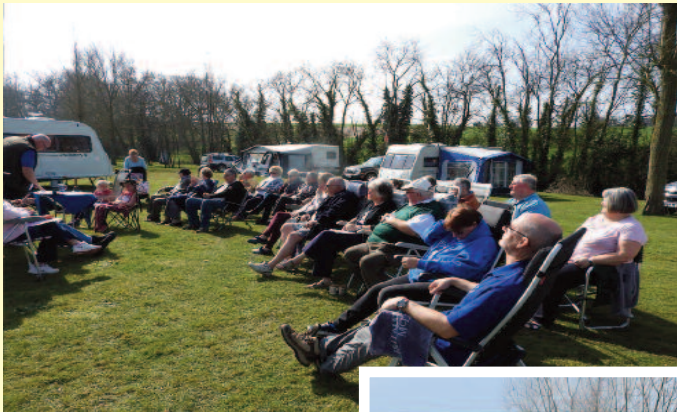
Above: Flagpole meeting in the sun