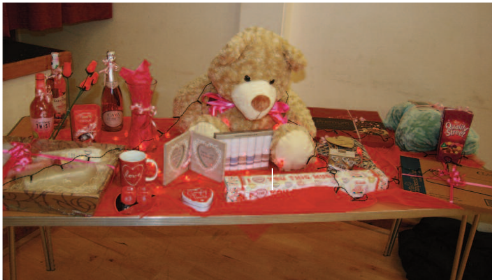
The raffle prizes