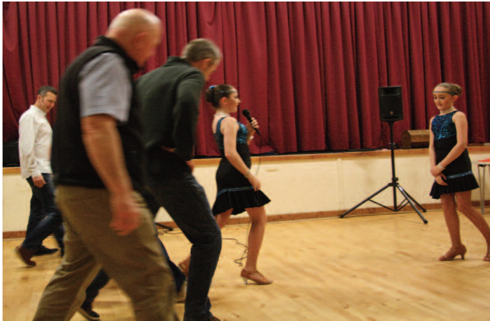
Now its the men's turn to be put through their paces.