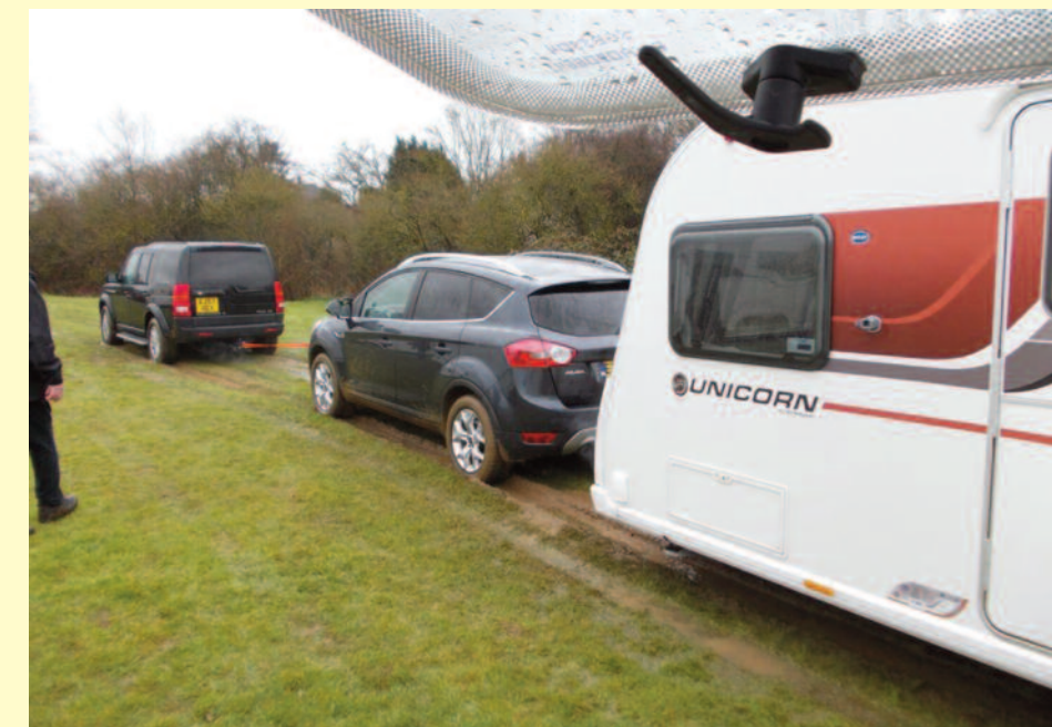
They towed them on and they towed them off a wet Easter weekend, but you can't keep a hardy rallier down!!

A glorious Good Friday dawned, 25 vans arrived at Dan's Meadow.