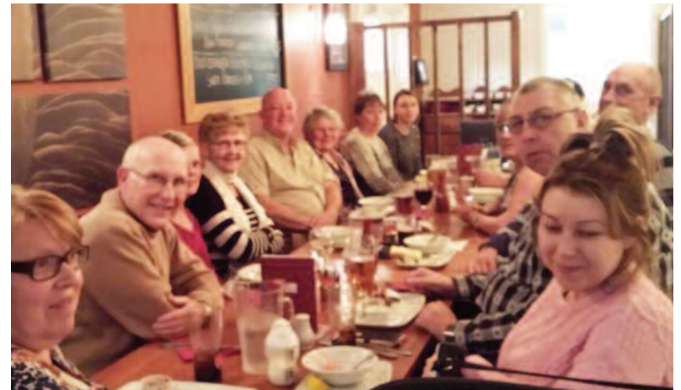
All seated in the restaurant at Waldegraves in West Mersea