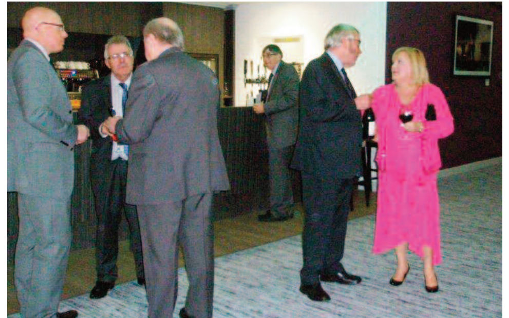
Pre dinner drinks in the bar