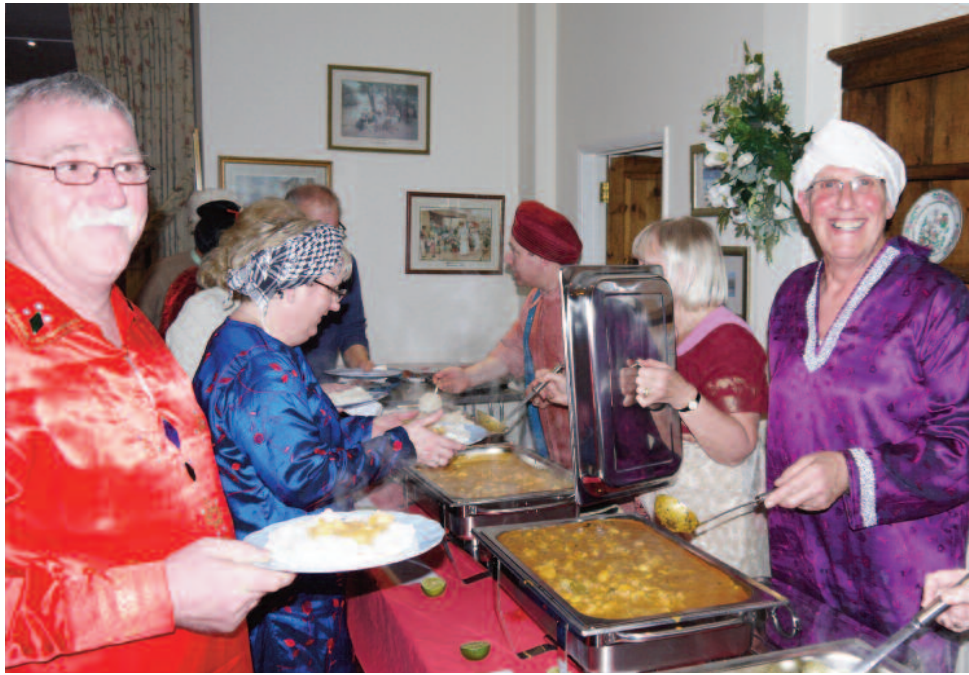
The marshals serving the members their rice and curry meal at Room in the Rodings