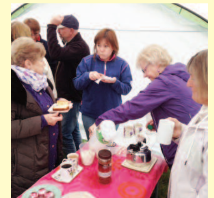
Inside the event tents out of the rain taking pleasure in the cakes and tea etc