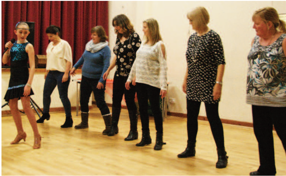
Top: Lady members taking dance instructions from our demonstrators. Below: its the men's turn.