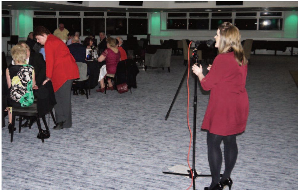
The singer about to perform for the members and guests at the Pre Season Dinner rally.