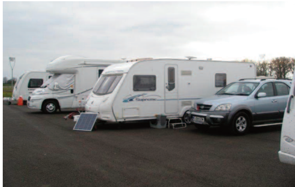
Vans parked up for the weekend