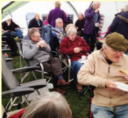
Members enjoying a cuppa and a slice of cake