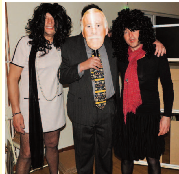
Above: Brucie and his two gorgeous assistants in Play Your Cards Right