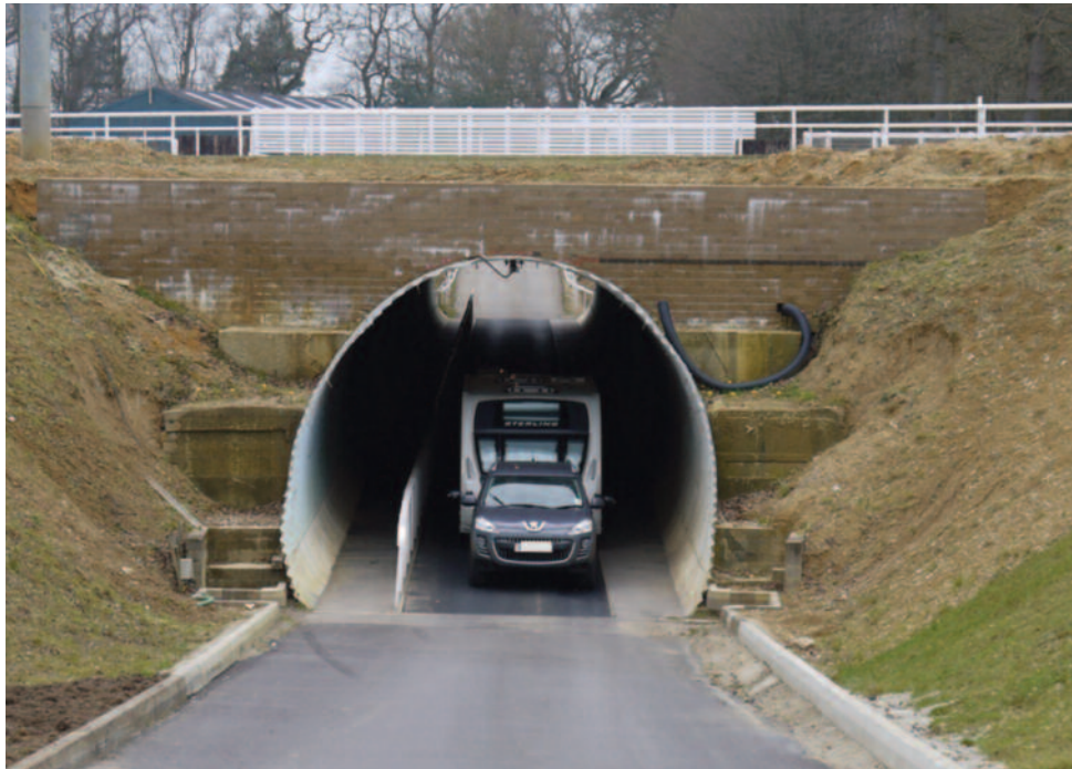
Literally under the horses feet!