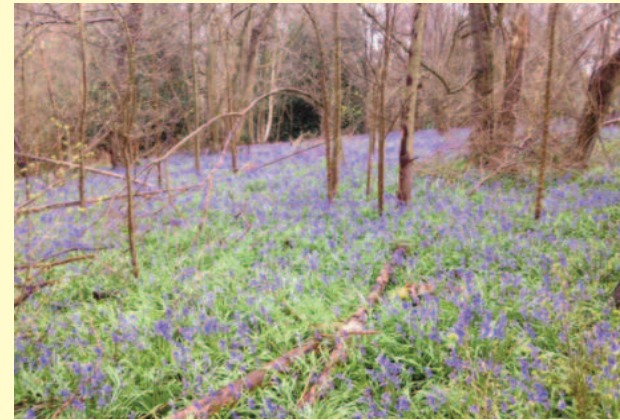
Beautiful bluebells at Arger Fen

Thanks to the marshals for the weekend and to the members for supporting the rally again we look forward to seeing you all again next year when we hope to alter the format somewhat watch this space!