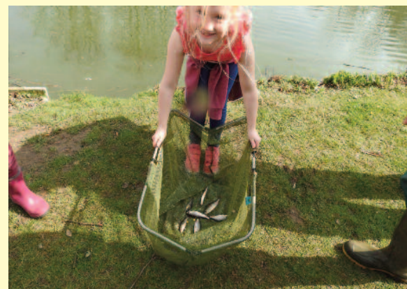
One of our young fishing contestants with her catch