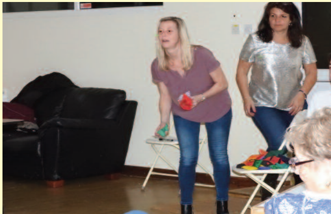
The bean bag competition in full flow