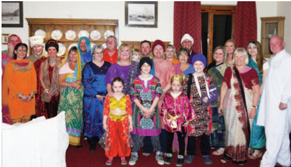
Members pose in their Indian dress for their Bombay Nights weekend