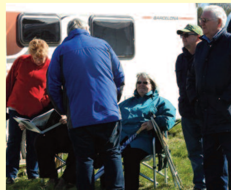
Enjoying the sun

The trophy for the Horseshoes winners will be presented at the AGM.