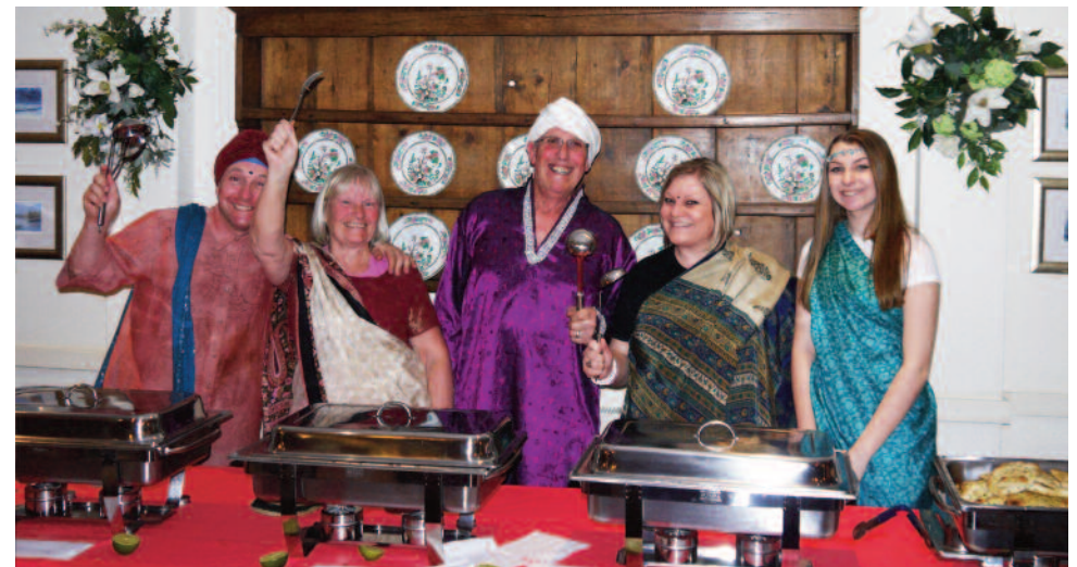
The Rally Marshals looking resplendent in their Indian attire ready to serve up their curry