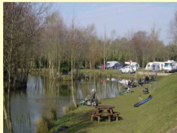
There were more than this in their Honest!!