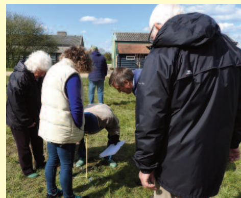
Another critical measurement